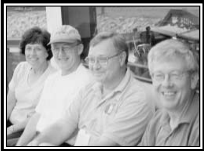
IGAEA members and spouses enjoyed a relaxing summer evening on the Hiawatha Riverboat. A grand time was had by all as we cruised the Susquehanna River. Some folks opted to stay on campus for an evening of movies.