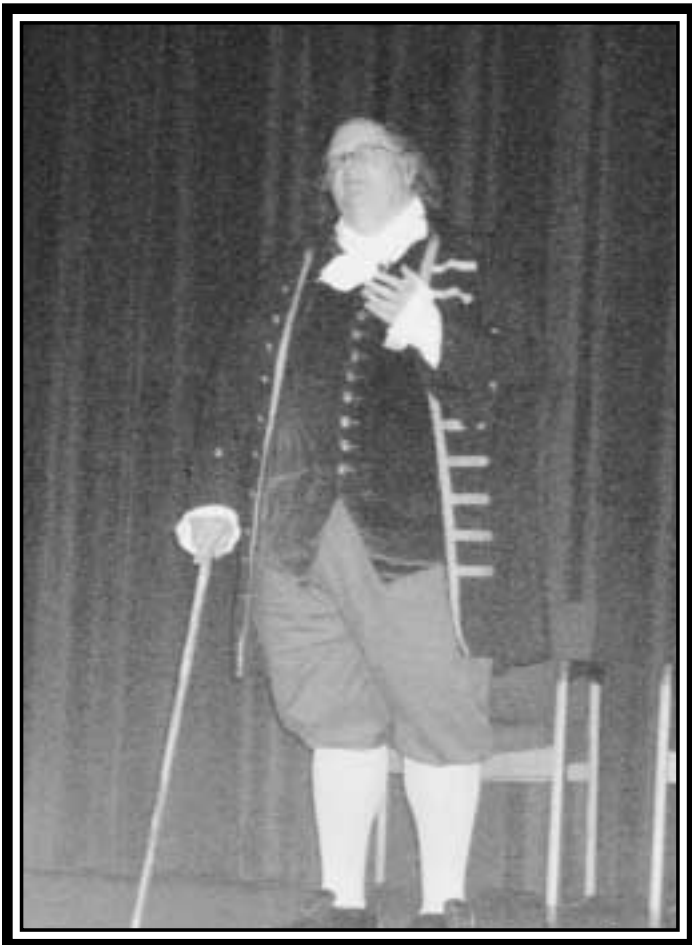
Keynote speaker "Benjamin Franklin" shared insight and wit about printing—and life in general—with IGAEA members, guests, youth, and children before heading off to address the Republican National Convention in Philadelphia.