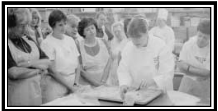
Guests participated in an excellent culinary demonstration and hands-on. All found it interesting to create items such as minted cucumber canapes, ganache, shrimp-filled profiteroles, and butter tea cookie sandwiches to name a few.