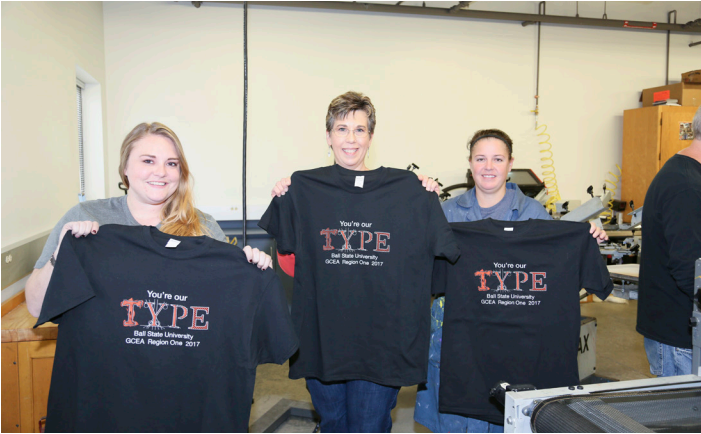
Conference attendees show off shirts made with discharge screen inks.