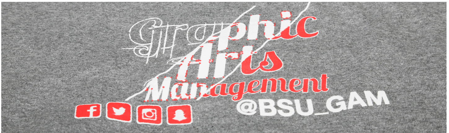
The Region 1 conference for GCEA was held November 3 and 4 at Ball State University in Muncie, IN.