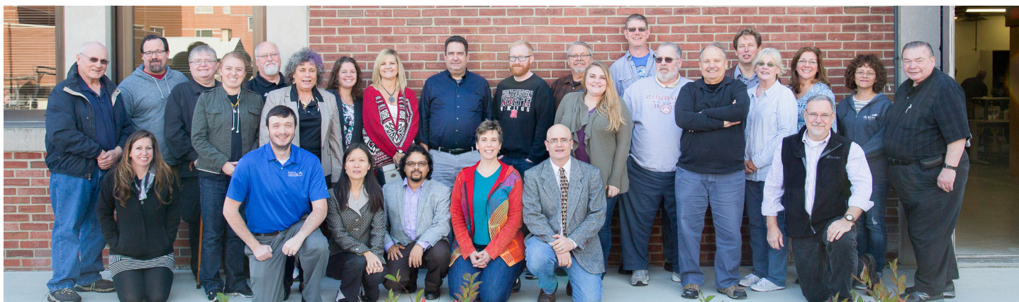
GCEA Region 1 Conference attendees.