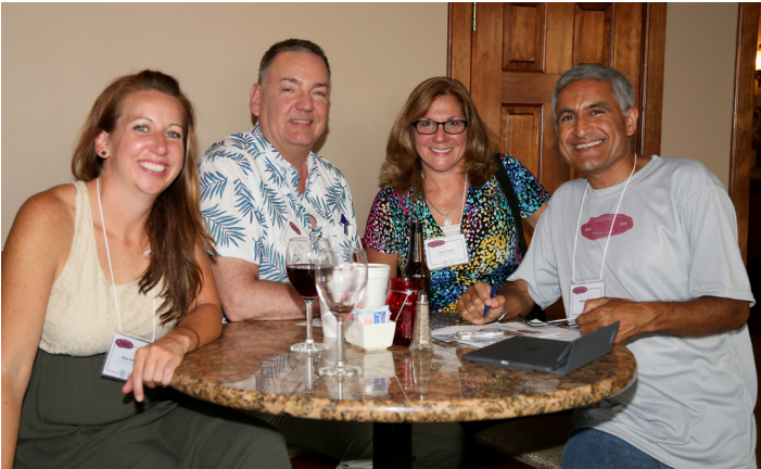
GCEA members enjoy networking during the president's reception.