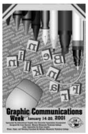
The 2000 Poster Contest Winner

This year, the format is changing to an 11" × 14.5" vertical format (colors may bleed) so that the poster can be easily reformatted to serve as the cover for the 2001 Visual Communications Journal.