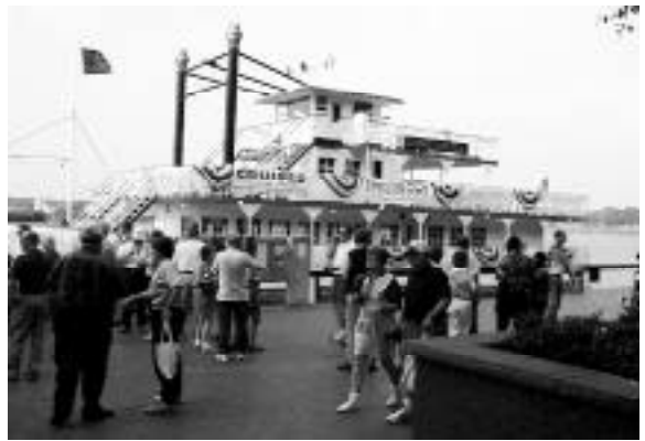
All Aboard! for Savannah River Cruising and Dining.