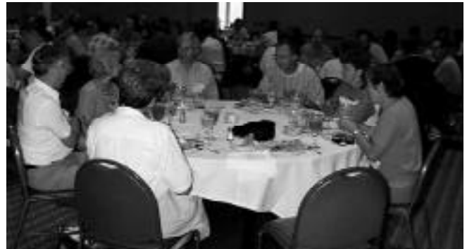
"This is the first Low Country Crab Boil for me."