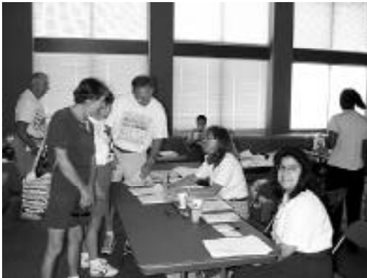
Registration was smooth and efficient thanks to GSU staff.