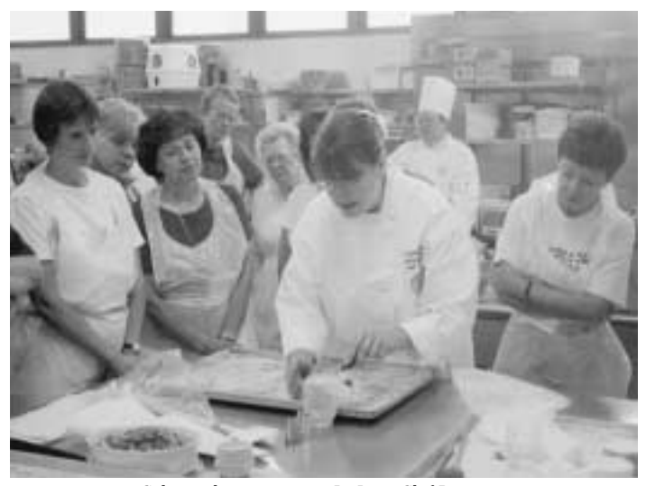
Culinary demonstration at Le Jeune Chef Restaurant

Our last full day of conference found us busy reminiscing