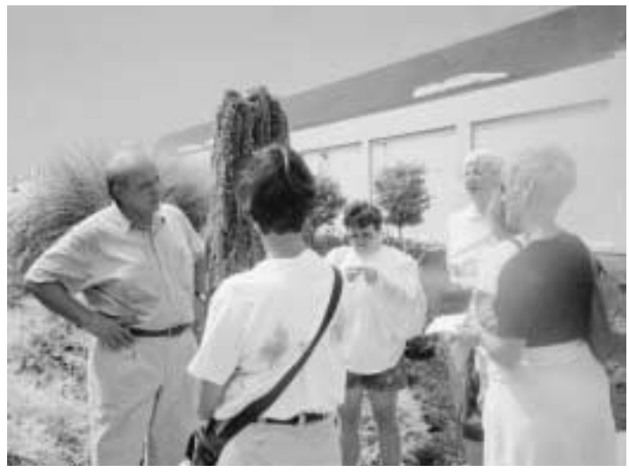
Guests enjoying the Horticultural Tour

about the past 75 years of IGAEA. The Anniversary Committee researched and created a book noting all past conference information. That book will be distributed soon.