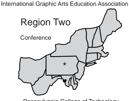
Pennsylvania College of Technology March 12 & 13, 1999

On March 12 & 13, 1999, twenty teachers and professors representing six states in the Northeast Region converged on Williamsport, PA. They assembled there for the IGAEA Region #2 Conference held at Pennsylvania College of Technology and discovered two of the best kept secrets in Pennsylvania — the printing and publishing program and the sticky buns at the City View Motel!