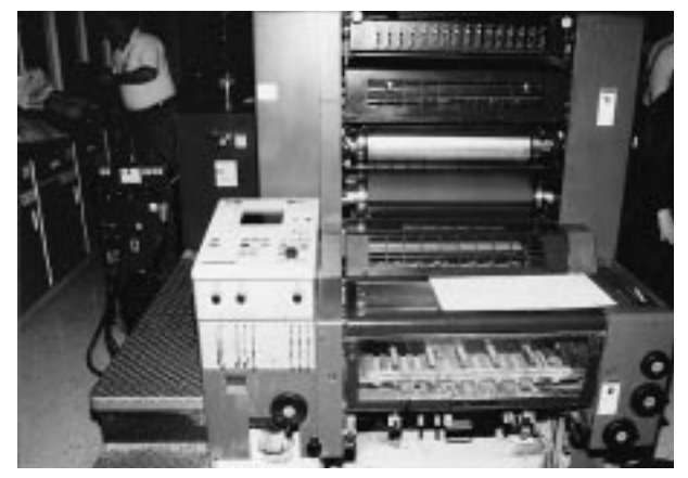
Heidelberg Speedmaster with CPtronics.

The conference was a successful professional development experience. Participants used state-of-the-art technologies to expand their expertise and learn new processes associated with the printing and publishing industry. The seminars that were offered dealt with digital imposition and preflighting, digital imaging with high-end scanners, various finishing and binding processes, screen printing fake color T-shirts, direct-to-plate with the Heidelberg Speedmaster, transmission and publication of digital media, and the SHOTS sheet-fed offset training simulator.