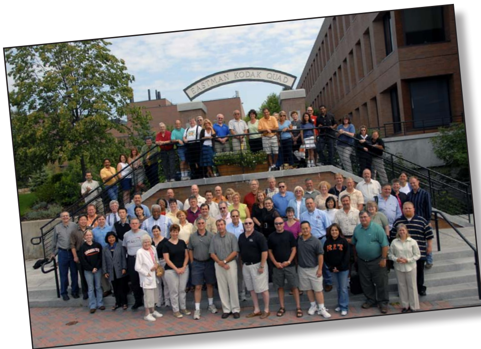
IGAEA members in front of the Eastman Kodak Quad