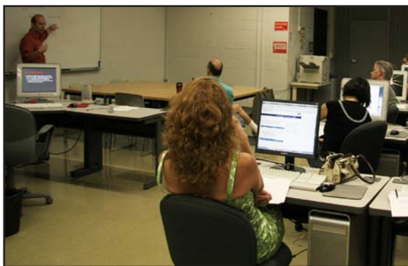
Conference participants were treated to many hands-on computer sessions