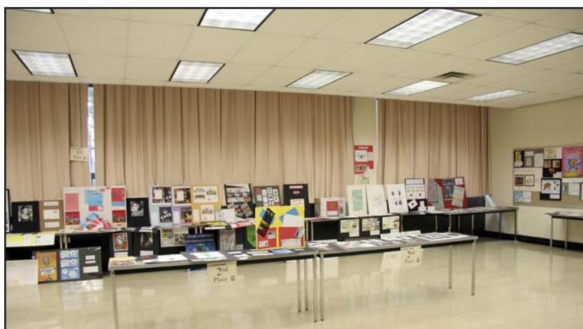
The many Gutenberg award entries took over a classroom. Be sure to have your students enter their designs into next year's Gutenberg Awards!