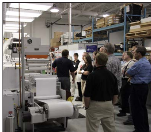
Conference participants get a hands on demonstration of a flexo press