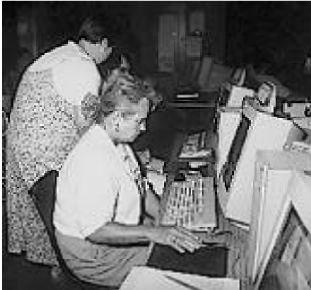
Serious workshops, hands-on, presentations, tours, discussions, demonstrations, and networking were all a part of the Conference!