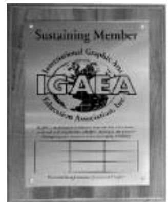
IGAEA's new plaque for Sustaining Members.

IGAEA board members will be searching out current and new Sustaining Members at Graph-Expo in Philadelphia and at SGIA in Dallas. Interested potential Sustaining Members are encouraged to contact one of the board members listed in this newsletter for further information, including a Sustaining Member brochure.