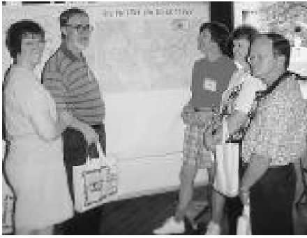
Registration begins with the placing of a pin on the map indicating your hometown.