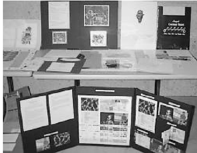
Some of the 375 entries for the Annual Gutenberg Awards competition on display at RIT for the 71st Annual IGAEA Conference.