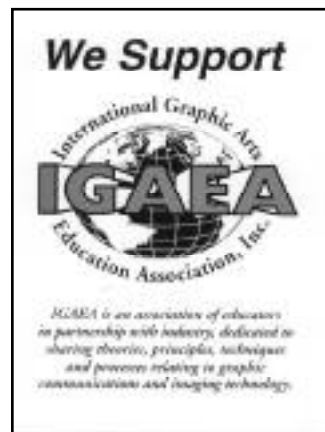
Easel card for use at booths of Sustaining Members.