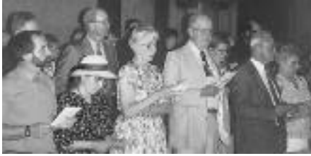
Sunday evening's Memorial Service gives us a chance to remember those of the IGAEA family that have departed since the last conference.